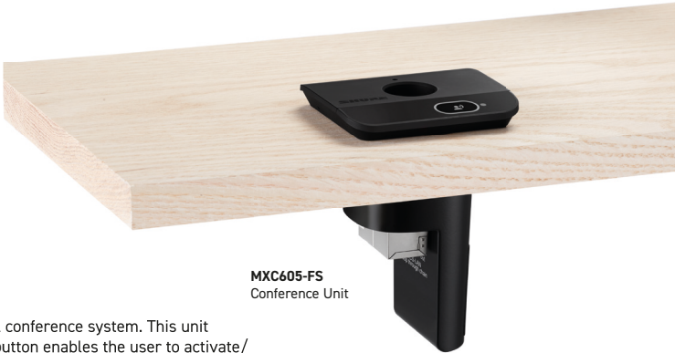
MXC605-FS Conference Unit