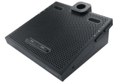
MXC615 Conference unit

*Dual Delegate operation requires a firmware update